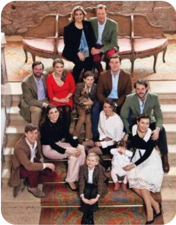
Left: Luxembourg's Royal Family

Right: Stephanie and her parents. She was the youngest of eight children of the Count and Countess de Lannoy.