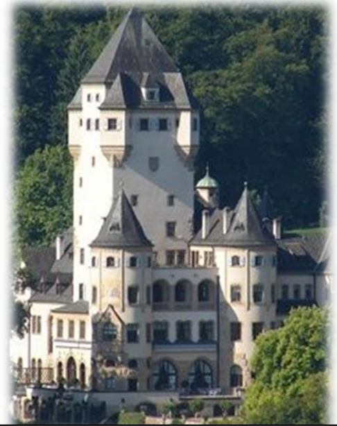
Berg Castle The Residence of the reigning Grand Duke, Henri

The couple also has a residence in London where they both are furthering their education.